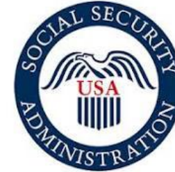
Social Security Administration (SSA)